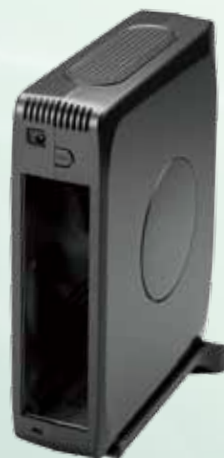
Rear Side Panel